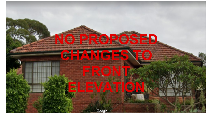
SOUTH EAST (FRONT) ELEVATION